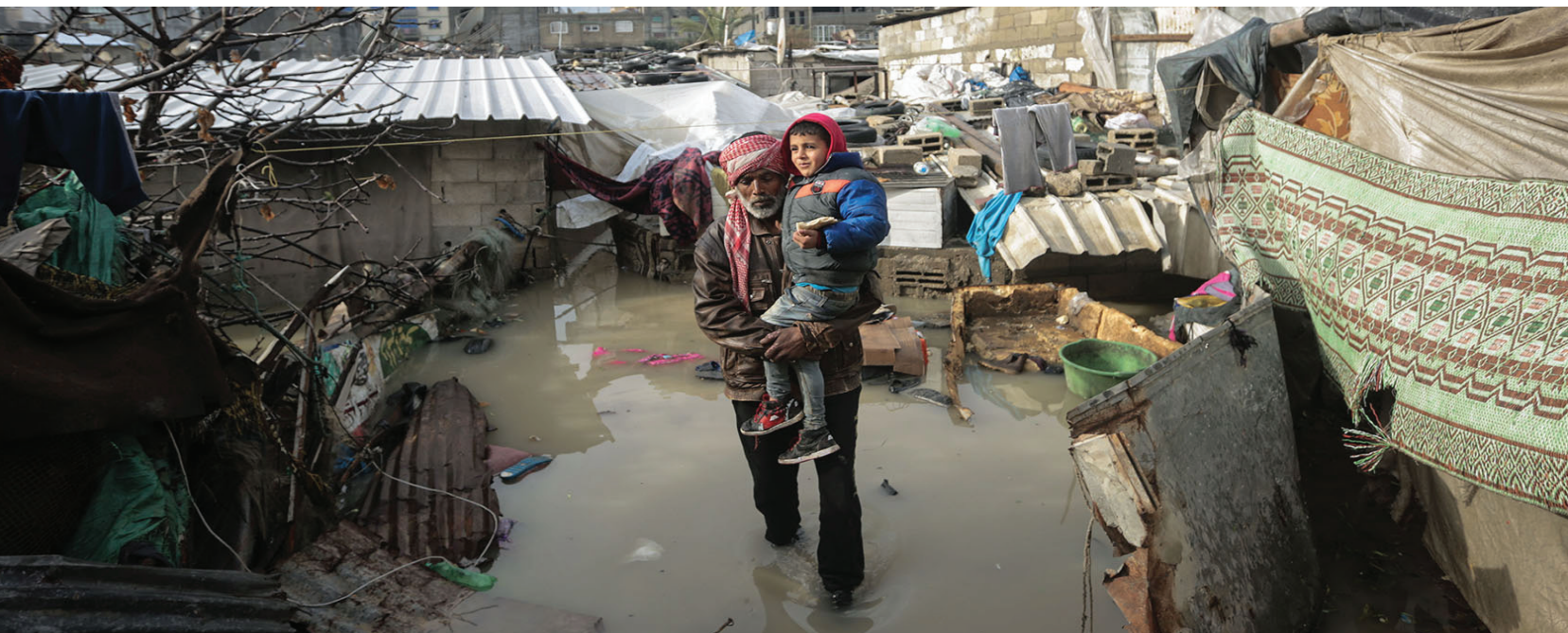
Residents of Gaza face great challenges in managing sewage and accessing clean water. During heavy rains, many neighborhoods in crowded urban areas flood with sewage and undrained rainwater.

This report looks at the deteriorating conditions of water, sanitation and wastewater management in Gaza, and the efforts by the Gazan people, together with some international actors, to forestall the further degradation of living standards in the region.