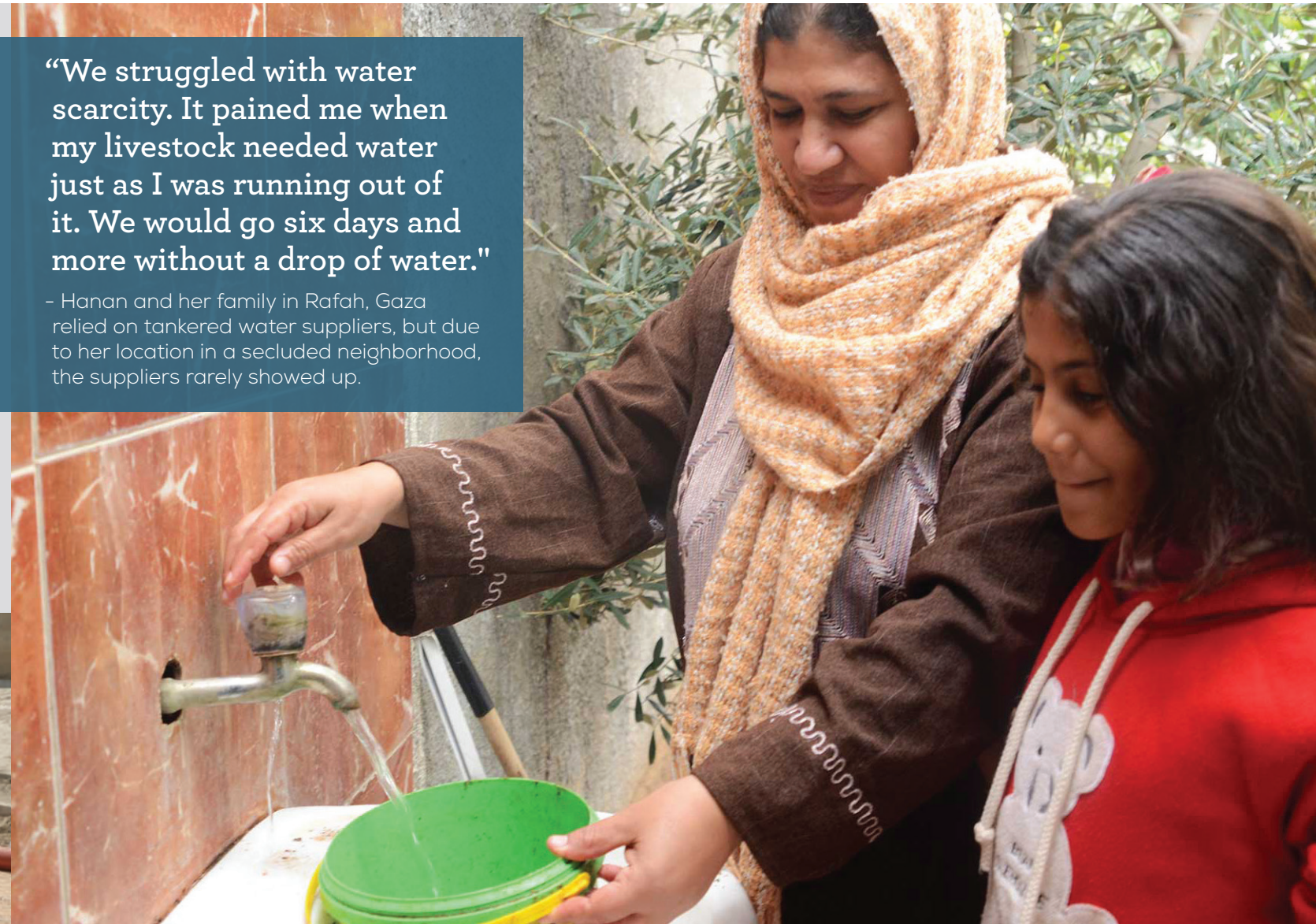
50,000 residents in the Jeneina, Mashro'a, Barazil and El-Salam areas of Rafah were connected to a reliable source of water. Anera replaced and repaired deteriorated and damaged water networks, reducing water losses and improving the overall water situation and quality of life for Rafah's residents.