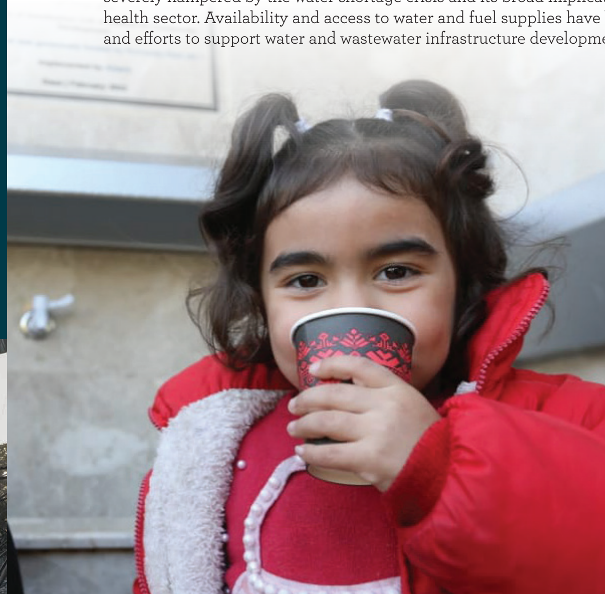
One of the ways Anera is combating Gaza's water crisis is through the installation of reverse osmosis (RO) desalination units at healthcare facilities and other community meeting points. This young girl drinks a cup of safe water from an RO unit installed by Anera at the Baytouna Community Center - meeting the needs of 30,000 residents living in the northern parts of Gaza.