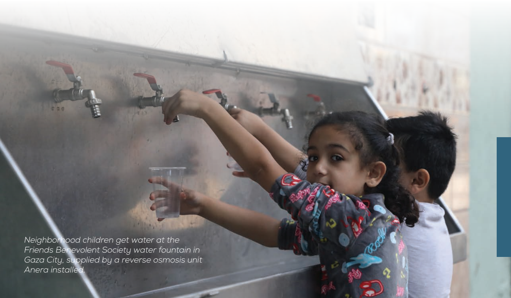
Neighborhood children get water at the Friends Benevolent Society water fountain in Gaza City, supplied by a reverse osmosis unit Anera installed.